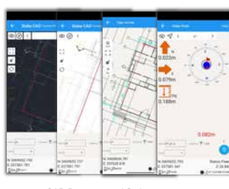
CAD Basemap and Stake